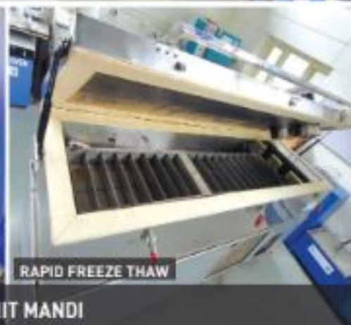
RAPID FREEZE THAW

CONSTRUCTION MATERIALS LABORATORY OF IIT MANDI